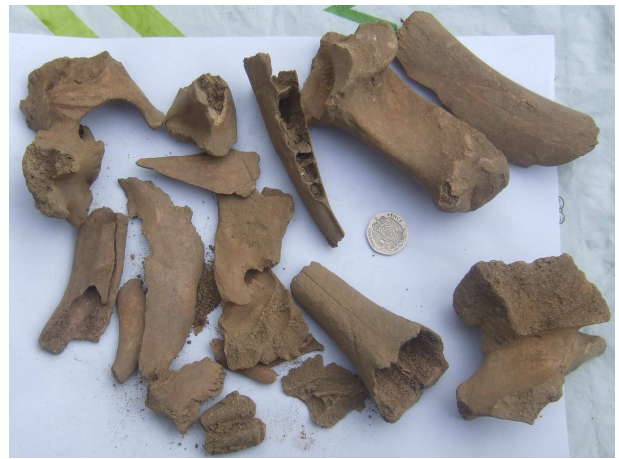
Various Animal Bones