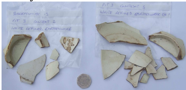
White Refined Earthenware –eighteenth or nineteenth century