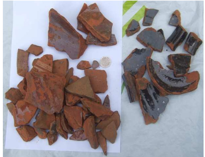
Local red clay pots, with red and black glaze. There were potters in Cranham and Painswick

This type of clay pot was typical for a long period from the thirteenth to nineteenth centuries.